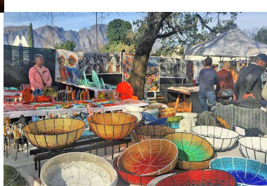
Franschhoek Village Market

A fully immersive social and cultural experience combining a walking tour, hands-on cooking workshop and a two-course lunch.