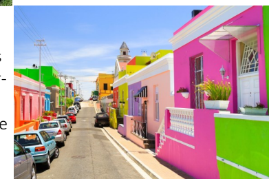
Bo-Kaap Cooking Experience

Franschhoek's wine tram allows vou to explore world-class wineries at your leisure. Enjoy the scenery of the vineyards en route to your next tasting stop.